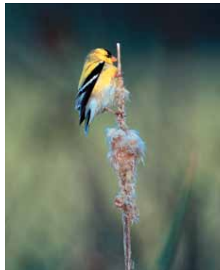
American Goldfinch on Cattail.

Recognizing their value, Samuel Hoar, a hunter, purchased a part of the Meadows in 1928. He built earthen dams or dikes to hold the water within these marshlands, enhancing their value as waterfowl habitat. In 1944, Hoar donated 250 acres of this land to the U.S. Fish and Wildlife Service. To provide greater protection for the area's wetlands and wildlife, the Service began buying additional land during the 1960s. Today the two units of the Great Meadows NWR contain over 3,800 acres of prime wildlife habitat.