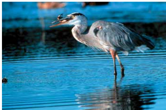
Great blue heron.

Native Americans named the Concord River "Musketahquid," meaning grassy banks. Settlers named the grasslands the "Great River Meadows." Hay was harvested annually and provided an important income for early settlers. With the advent of industrialization in the early 19th century, a mill dam was built in Billerica. The dam caused the river's water level to rise and to extend into the Meadows. The newly created habitat became increasingly attractive to waterfowl. The wetlands became highly valued for hunting and fishing.