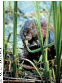
K. & L. Brown

One of the major wildlife management efforts underway at Great Meadows NWR is the control of exotic plants. Plants such as purple loosestrife (the tall purple flower seen in disturbed areas) and water chestnut (the small green plant that forms a carpet over open water) have little to no wildlife value and are out-competing our native vegetation. Several methods of control have been attempted at the refuge: everything from hand-pulling plants, to chemical applications, to flooding the marshes. For purple loosestrife, the release of weevils and beetles native to the European home of loosestrife, seems to be the best management solution. These insects feed only on purple loosestrife.